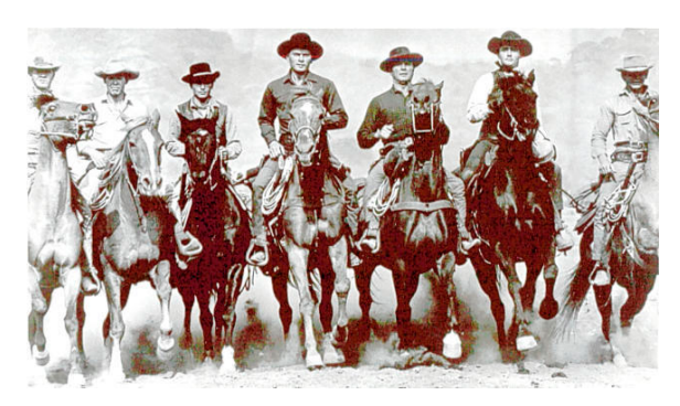
A remake of the 1960 Western "The Magnificent Seven," above, will be filmed in New Mexico.